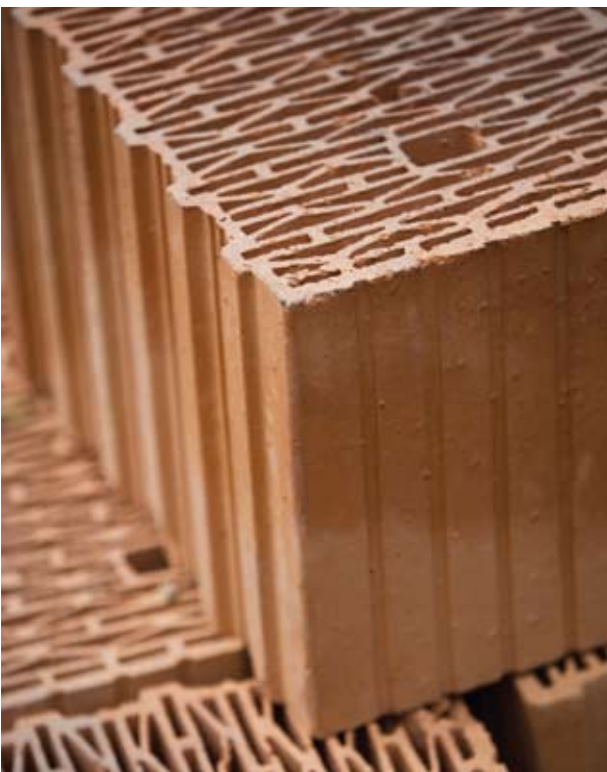
Above: Aerated clay 'Ziegel' block produced by Thermoplan Right: Block is laid into thin-bed mortar on site