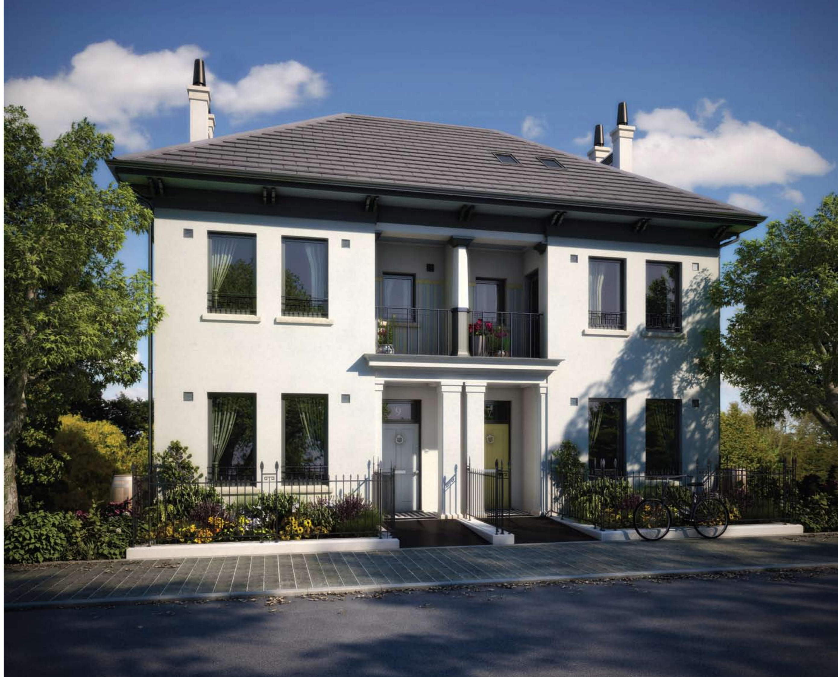
Rendering of 'The Natural House' designed by The Prince's Foundation for the Built Environment